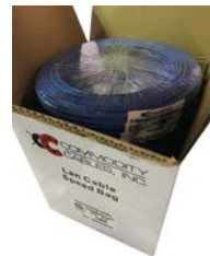
900' Pull Box/Speed Bag Weight: lbs.

Toll Free: (866) 945-5051 Local: (770) 945-5051 Fax: (770) 945-9582 www.commoditycables.com