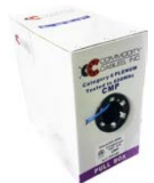
1000' Pull Box Weight: 32 lbs.