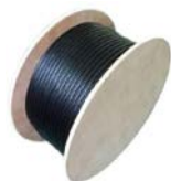
1000' Wood Reel Weight: 42 lbs.