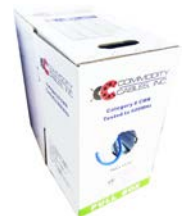
1000' Pull Box Weight: 29 lbs.