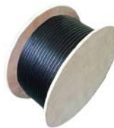
1000' Wood Reel Weight: 48 lbs.