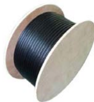
1000' Wood Reel Weight: 95 lbs.

Toll Free: (866) 945-5051 Local: (770) 945-5051 Fax: (770) 945-9582 www.commoditycables.com