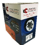
1000' Pull Box Weight: 25 lbs.

Toll Free: (866) 945-5051 Local: (770) 945-5051 Fax: (770) 945-9582 www.commoditycables.com