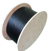
1000' Wood Reel Weight: 45 lbs.